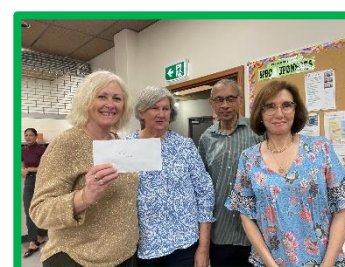
3 rd place - Team Menezes