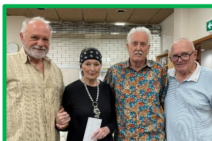
2 nd place - Team Isle