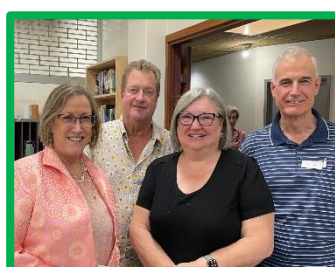
2 nd place - Team Leybourne