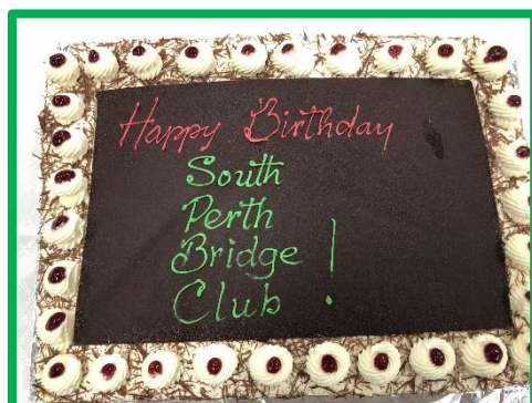
Scrumptious birthday cake