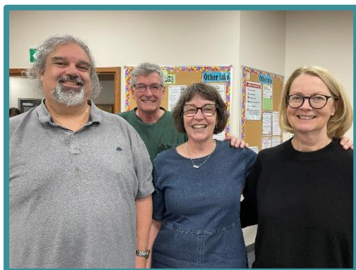
1 st place - Team Collett