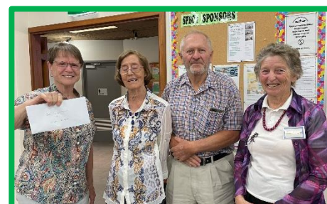
3 rd place - Team Steed