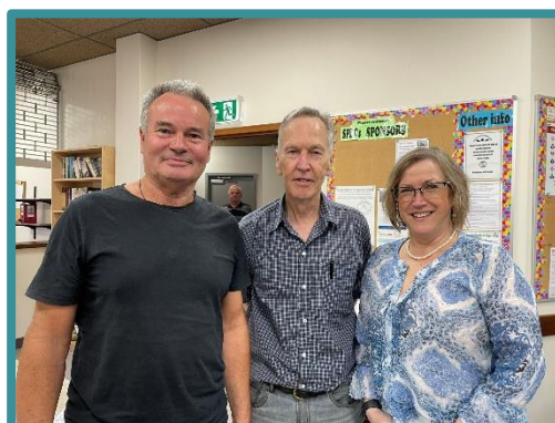
5 th place - Team Lemann