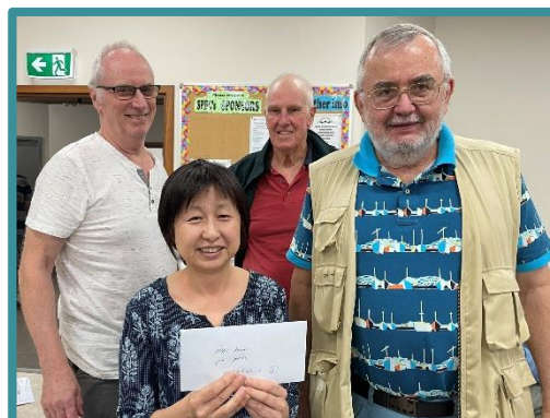
4 th place - Team Nakamatsu